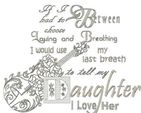
Dass00101073-14x14.pes 13.60x10.88 inches; 53,453 stitches 2 thread changes; 2 colors