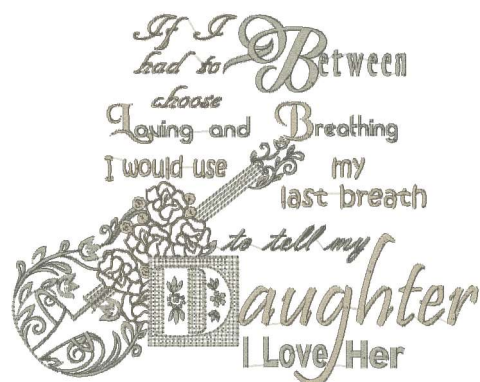
Dass00101073-8x8.pes 7.69x6.16 inches; 31,435 stitches 2 thread changes; 2 colors