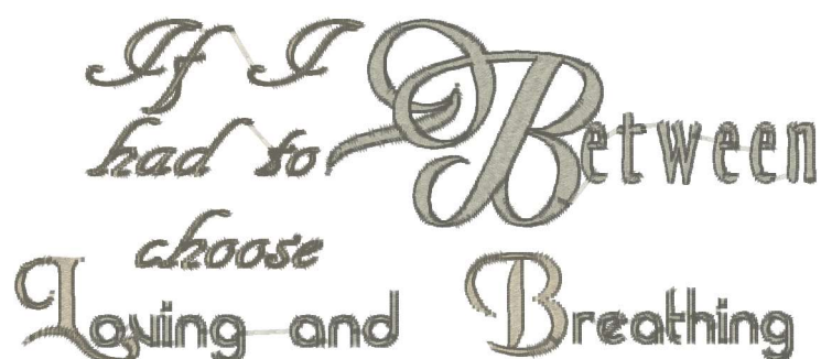
Dass00101073-Top-5x7.pes 4.95x2.13 inches; 7,541 stitches 2 thread changes; 2 colors