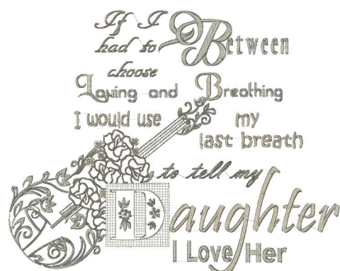
Dass00101073-12x12.pes 11.63x9.31 inches; 46,273 stitches 2 thread changes; 2 colors