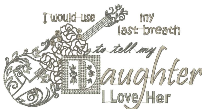
Dass00101073-5x7-Bottom.pes 7.69x4.15 inches; 23,760 stitches 2 thread changes; 2 colors