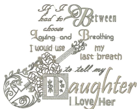
Dass00101073-10x10.pes 9.66x7.73 inches; 38,650 stitches 2 thread changes; 2 colors