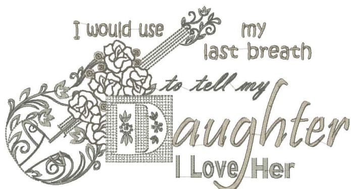
Dass00101073-6x10-Bottom.pes 9.66x5.22 inches; 29,525 stitches 2 thread changes; 2 colors